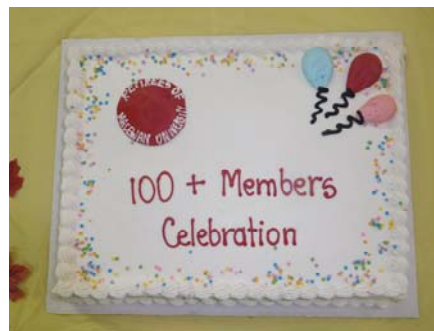
Cake from our fall kick off